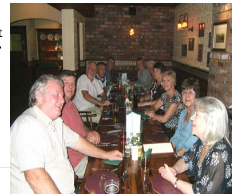
Enjoying an evening meal in Somerset