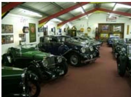
Some of the beautiful cars at Churt Museum

Their collection of about 40 cars are taxed and road legal and are used regularly. Robert allowed us to sit in the cars fiddle with the controls and dream. After dragging us out of the museum we were given a guided tour of the wonderful garden and ended the day having a picnic in the grounds. BCCC along with some members of the MG club had a very good turnout. A visit to the museum is by personal invite to classic car clubs only. Robert and Tanya do not make a charge to visit but welcome contributions to their chosen charity - Help the Heroes. Our members on the day suggested to the committee that BCCC should consider making a small contribution to this very worthy cause and a donation of £50 pounds was duly agreed and sent off. A visit next year is on the cards and we are told to expect more cars. I am sure Brian will keep us posted.